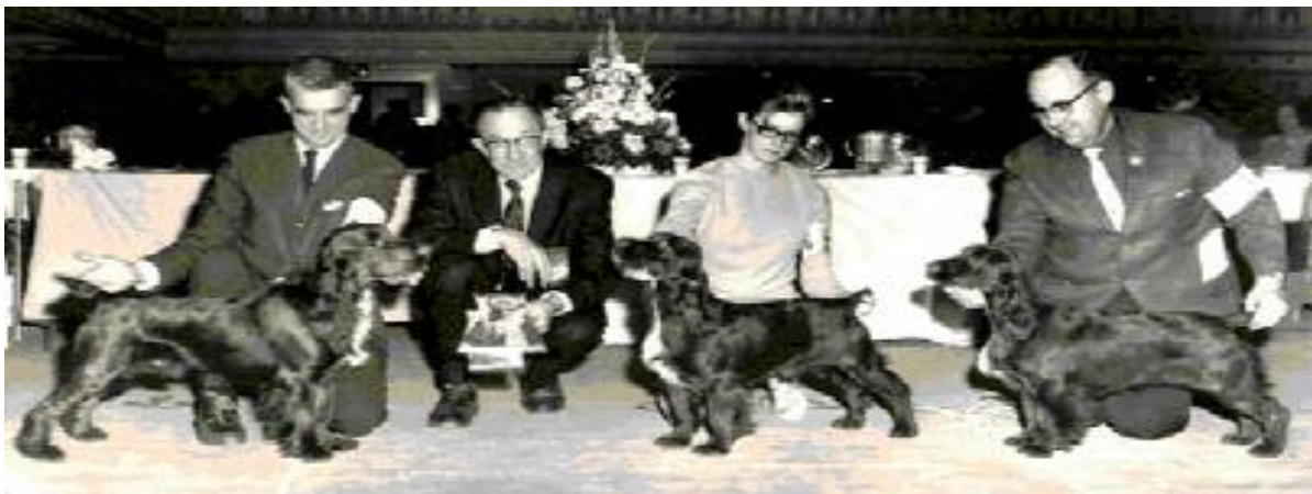
Imports at the ASC Flushing Breeds Specialty Show 1968