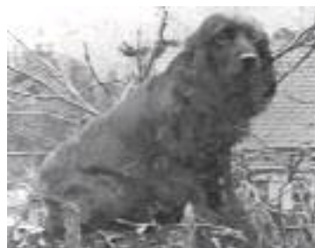
FS CH Black Prince AKC 12524 whelped 7/15/1881 resembled his FS sire CH Benedict. (Kaye, C., 2007, para. 2)